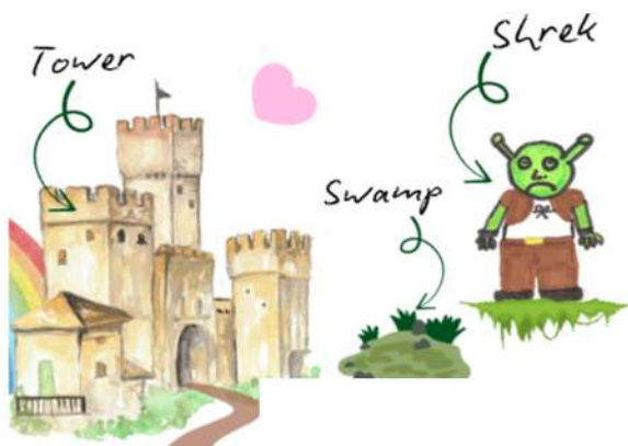
Graphics provided by Ruby, Zara & Layla B

Complete the link sent via text to confirm tickets